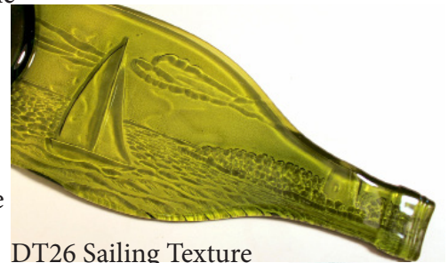
DT26 Sailing Texture