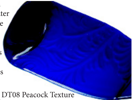
DT08 Peacock Texture