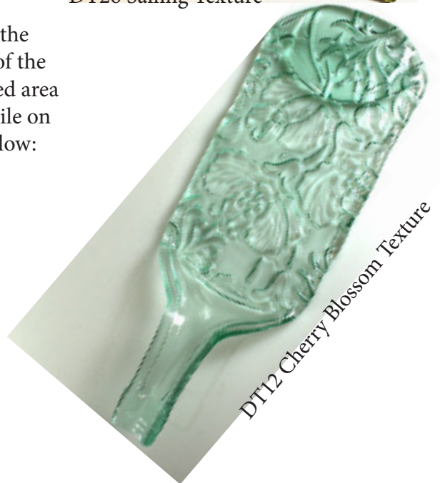
DT12 Cherry Blossom Texture