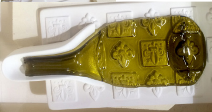
DT16 Fleur De Lis Texture