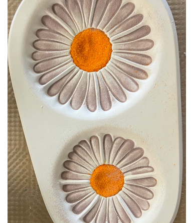
Place Fine Orange Opal over the Sunflower in the center.