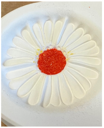
Place Powder Sunflower Opal in the center of the flower, then cover with Fine Flame Opal.