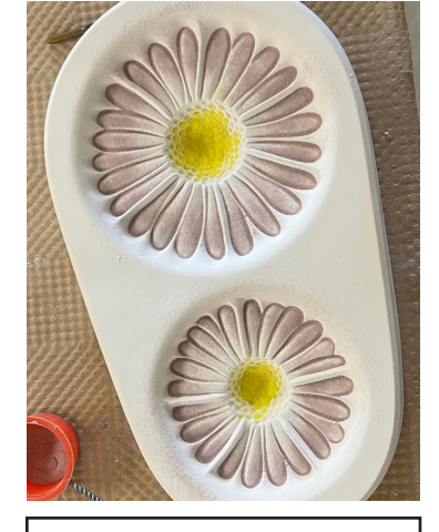
Begin with Powder Sunflower in the centers of the flowers and sift Plum Opal into the petals.