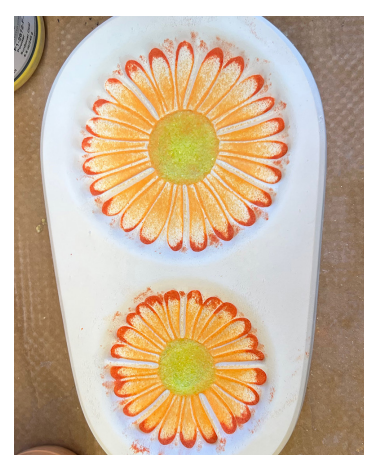
Sift Powder Orange Opal into the bodies of the petals, and Powder Flame Opal onto the edges, as pictured above.