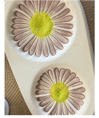
Layer Fine Lemongrass Opal over the Orange Opal.