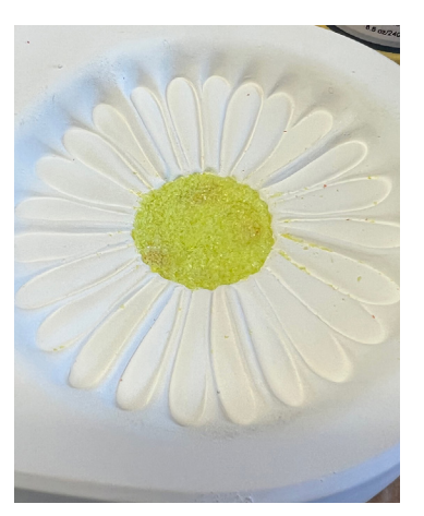
Place Fine Lemon Grass Opal over the Flame Opal.