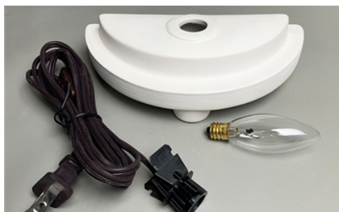
Pictured above: CPI LBG267 Lamp Base Kit

After the paint is dry, insert the clip light through the hole in the bottom of the base and place the bulb into the socket. If desired, use hot glue or an epoxy to adhere the snowman to the base