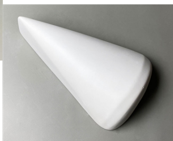
Pictured below: CPI GM267 Conical Drape