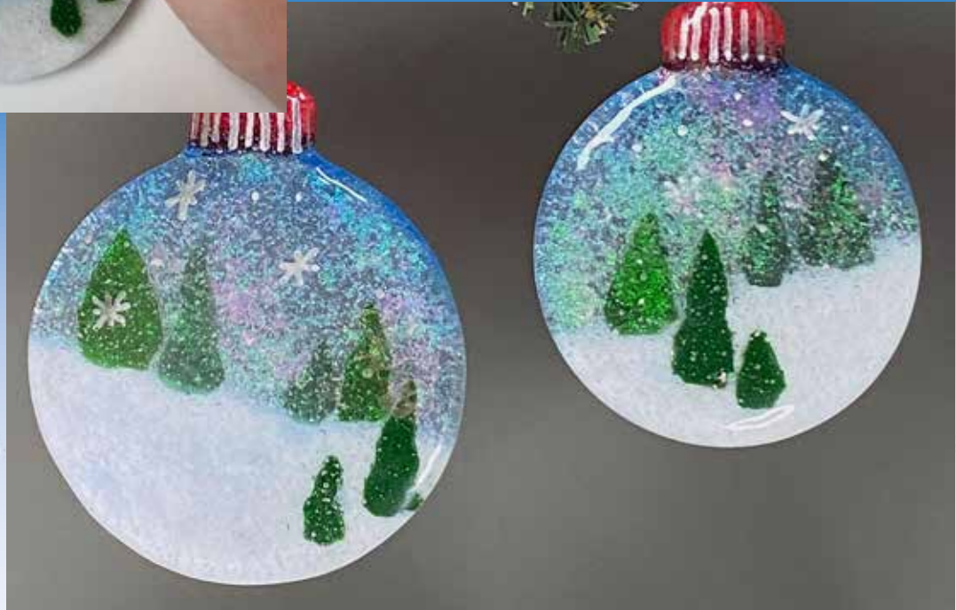
Table 1~ Full Fuse

To add a touch of sparkle to your ornaments, you can use metallic paint pens. Here, we used a Liquid Chrome pen to add silver lines to the caps of the ornaments and a few silvery snowflakes in the sky.