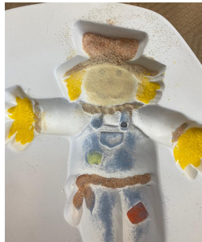
Sift some F1 Medium Amber into the scarecrow's face.