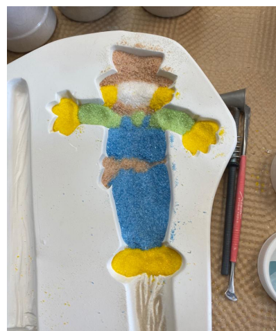
Add F2 Amazon Green to the sleeves. Fill the hat, belt, and scarf with F2 Terracotta.