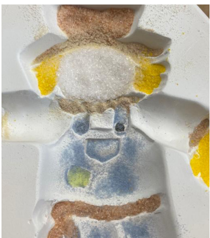
Sprinkle some F1 Navy into the denim overalls, and some F2 Champagne into the face.