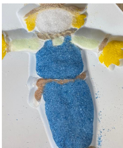
Sift F1 Light Green into the sleeves, and place F2 Mariner Blue into the overalls.