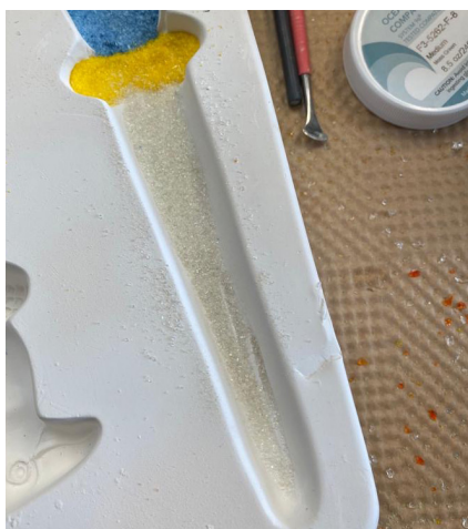
Place some F2 Cloud along the whole stake.