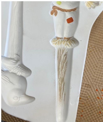
Sprinkle F1 Olive Green down into the stake portion of the mold.