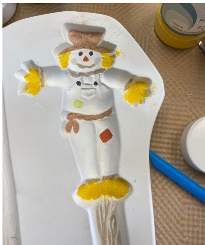
Place F2 Sunflower into the straw hair, feet, and hands, then add some F2 Terracotta into the hat.