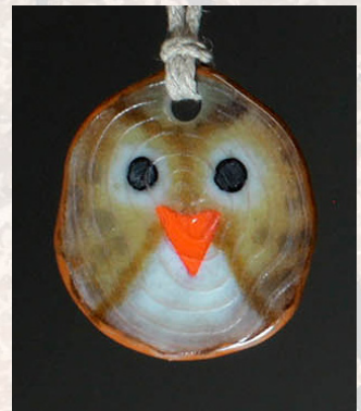
COE 96 - Powder Bronze in grain and base of belly. Nipped Orange Opal beak, nipped Black rods eyes, Powder Dark Amber wing lines and face outline. White powder around Black rods in eyes and belly. Powder Olive Trans spots on wings and on top of head. Fine Almond backed with medium Clear to fill.