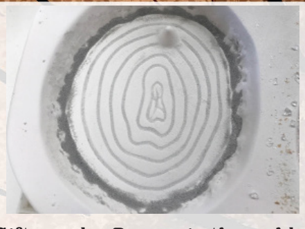
Sift powder Bronze in the mold cavity. Use a finger to gently sweep the Bronze into the wood creases. Place powder Pewter Opal frit in the bark crease.