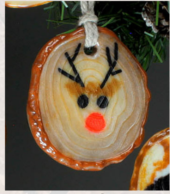
COE 96 - Powder medium Amber in grain, ears/top of head/bark powder Chestnut, nipped Flame nose, nipped Black Rod eyes, Black stringer as antlers. Sift pale amber in wood back with fine and medium Almond.