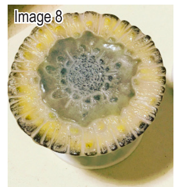
For more visit www.creativeparadiseglass.com