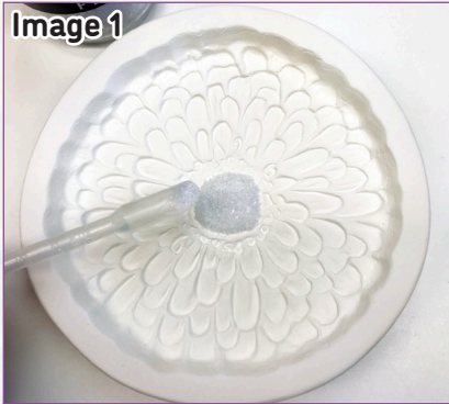
Once the separator is dry, fill the center with Fine Ruby Pink Tint. A cut plastic eyedropper makes for a great frit scoop.

Prepare the mold thoroughly with suitable glass separator before beginning. We recommend spray-on ZYP. Always wear a mask when applying spray-on separator or using powder frits.