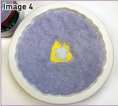
Back the petals with a layer of Fine Neo Lavender Opal.