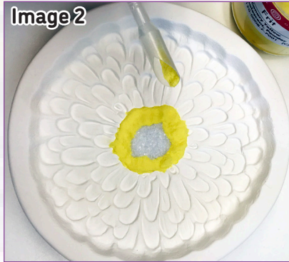
Add a ring of Powder Canary Yellow around the center.