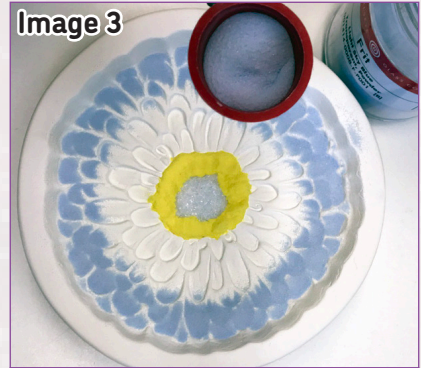
Sprinkle or sift Powder Light Sky Blue in a ring around the outer edge of the petals.