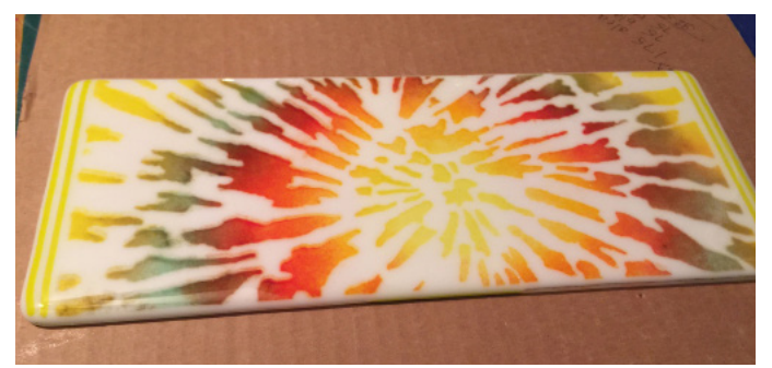
The top of the piece after the project is fused and removed from mold.