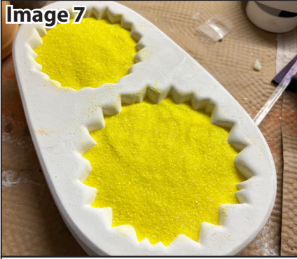
Image 7 Back each flower with F2 Yellow Opal until each is about 1/4" full. Transfer to a level shelf in the kiln and fire using the schedule in Table 1 or your own preferred Tack Fire. *