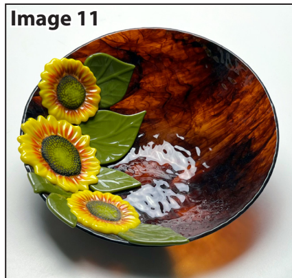
Image 11 Transfer the decorated circle to a suitably sized sheet of Kiln Shelf Paper on a level shelf in the kiln and fire using the suggested schedule in Table 1 or your own preferred Tack Fire.

To overlap the flowers and leaves, arrange the leaves under the flowers as desired. Trace the area of flower overlap onto each leaf, then either nip or grind the overlapping portion off the leaves and return them to their positions.