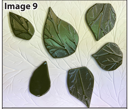
Image 9 Transfer the mold to a level shelf in the kiln and fire using the suggested schedule in Table 1 or your own preferred Tack Fire.

* Repeat the steps in Images 1-7 to make an additional small sunflower if desired.