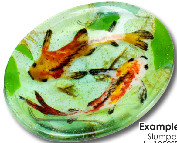
Example 2: Slumped to 1250°F in Segment 2

*Before firing, it's important to know your kiln to see if you need to adjust our suggested schedules for your use. For tips on how to do that, please click here to see our Important Firing Notes!