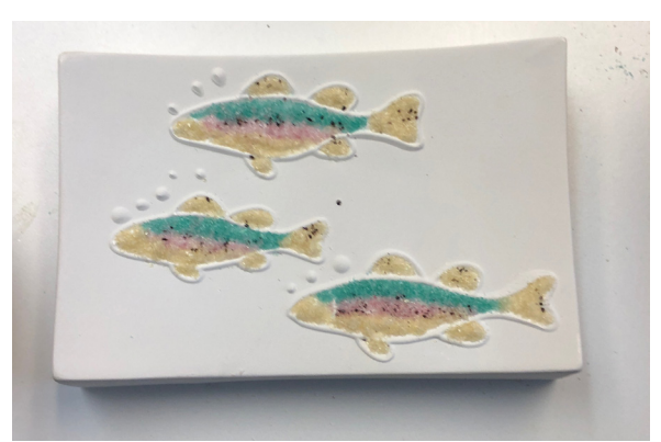
Sprinkle some F2 Black frit here and there on the fish bodies.