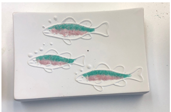
Underneath the Teal, place some F2 Turns Pink Trans.