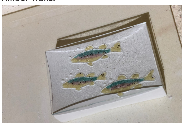
Cut a 5.75" x 3.5" rectangle out of 3m clear fuse-able sheet glass and place it on the mold in your kiln. Fire using the schedule found in table 1.