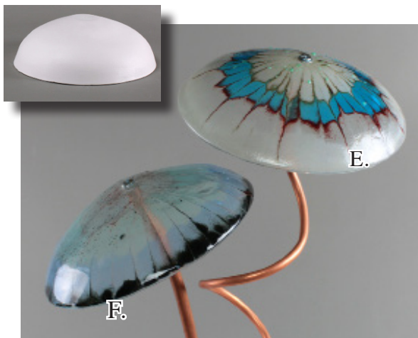
Slurry mushrooms formed on GM207

Using the “Frit Slurry” technique alongside Creative Paradise draping molds allows for the creation of all shapes, sizes, patterns, and colors of mushroom imaginable! For more information about making frit slurries, check out our tutorial on the basics by clicking here.