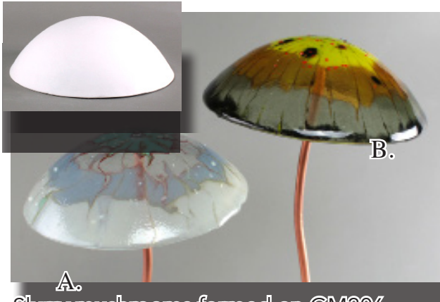
Slurry mushrooms formed on GM206