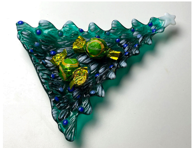
Christmas Tree slumped on GM268 Triangle Slump Mold. Slumped using the suggested schedule in Table 3.