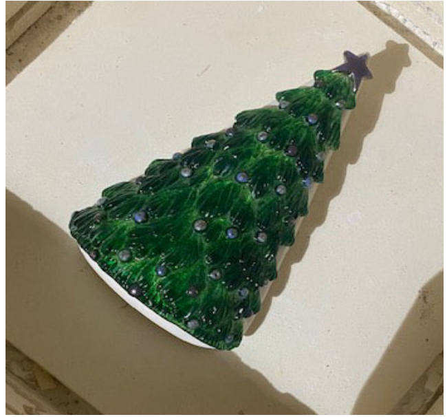
Fire the glass on the drape using a drape firing schedule 2.