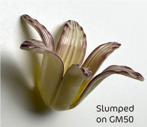
Slumped on GM50

We have a wide variety of slump molds that work well for the Lily. One that we also use frequently is the GM195 Organic Controlled Drop (see below). If firing on this mold or a similar deeper slump, fire the Lily texture-side up. You may also want to slightly increase the top temperature in the suggested Slump schedule to 1290°F or so for a deeper slump. But don't increase this temperature if you're using the GM50!