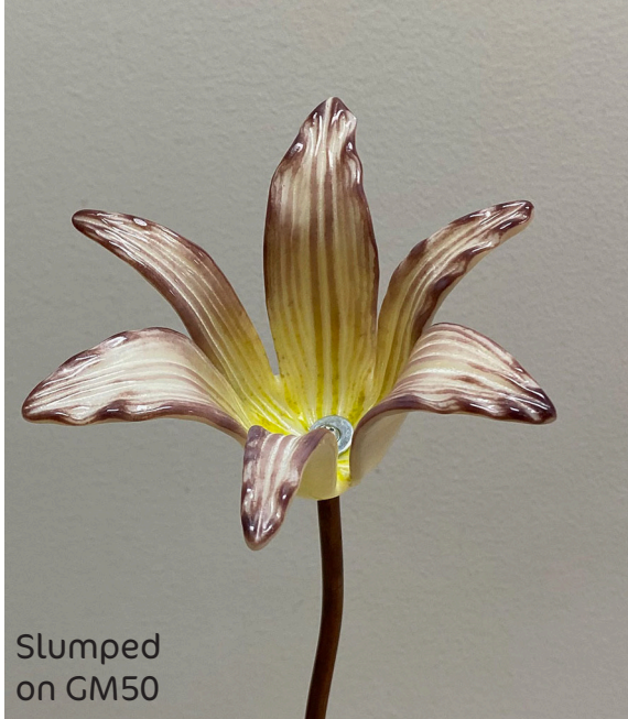
Slumped on GM50

Click here for our tutorial on stemming glass flowers like these!