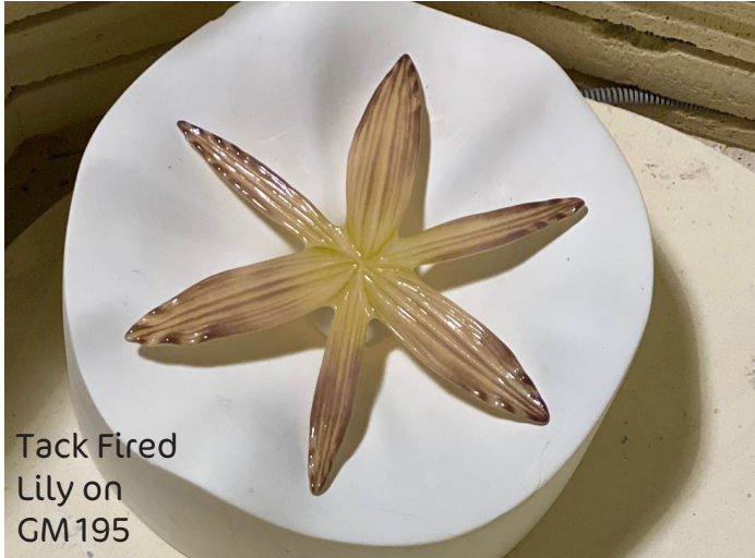
Tack Fired Lily on GM195