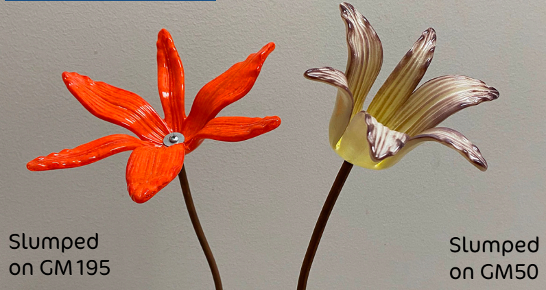
Slumped on GM195

Click here for our tutorial on stemming glass flowers like these!