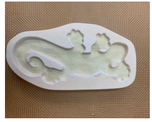
Cover the Pale Amber frit with F2 Almond Opal.