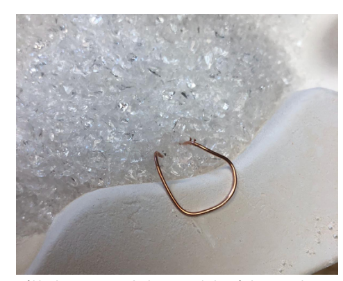
Fill the rest of the mold with F2 Clear frit until the total amount of frit weighs around 296 grams.

If you want to hang up your gecko, you can place pieces of 18-gauge copper wire bent into U-shapes (see above) on the points where you'd like the piece to hang. Make sure the curved side is out of the frit and leaning against the mold wall so it doesn't get covered with glass.