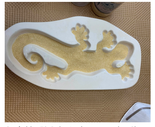
Sprinkle F2 Pale Amber over the Clear.