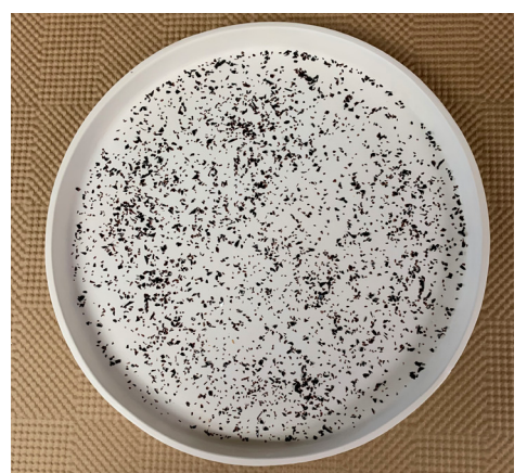
First, make some black dots for patterning your gecko. Sprinkle F3 Black frit onto a kiln shelf treated with separator. We like to use our Patty Gray Round Dam molds for this, as their edges stop the dots from rolling away. Fire using your favorite Full Fuse schedule or the suggested one found in Table 1.

***Make sure you properly coat your mold with glass separator before beginning! If using a spray-on separator and/or Powder frit, make sure to wear a suitable respirator mask.***