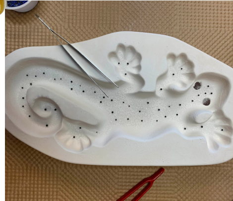
Once the dots have fired and cooled, sprinkle some F2 Clear frit in the gecko. Use tweezers to pick up the dots and place them in various places. The Clear frit will help keep the dots in place.