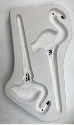
Begin by sifting powdered Black frit in the beak, eyes and legs.