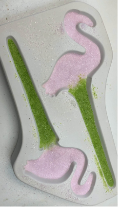
Place fine Spring Green Trans. frit in the entire grass area. Fill all raised areas of the mold in this area.