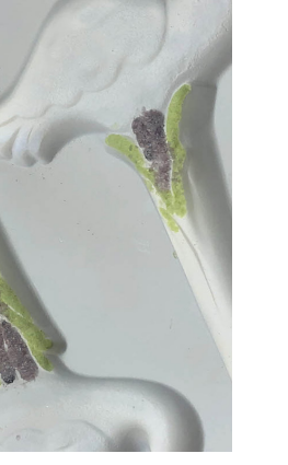
Add fine Dusty Lilac Opal frit over the black in the legs.