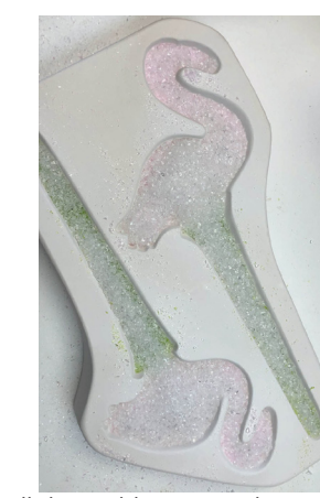
Fill the mold cavity with medium Clear frit. The Small Flamingo should weigh 105 grams and the Large Flamingo I20 grams. Fire the project to a Full Fuse using the suggested schedule in Table I or your own preferred Full Fuse