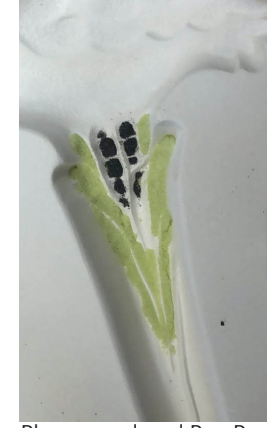
Place powdered Pea Pod Opal in the top areas of the grass around the legs.