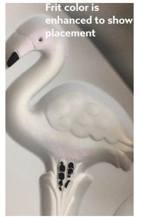
Place powdered Salmon Pink Opal frit in the head and belly.