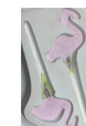
Place fine Petal Pink Opal frit over the body, neck, and head of the flamingo, covering all of the raised areas in this part of the mold.