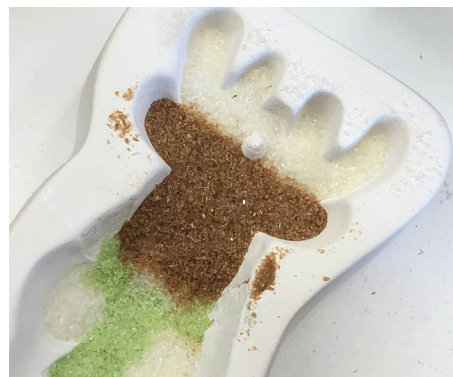
Back the entire face area with F2 Chestnut.