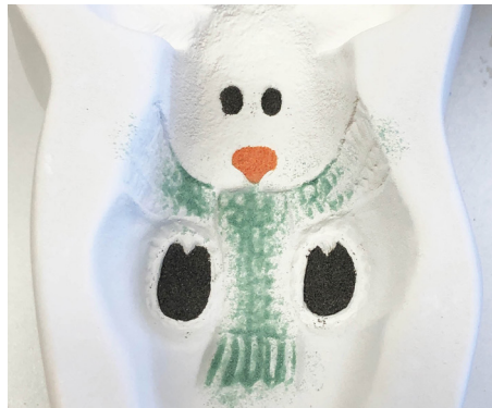
Sift a small amount of F1 Hunter Green into the details of the scarf.