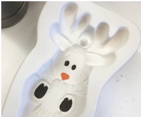
Sift F1 Black Opal into the eyes and hooves, and F1 Flame Opal into the nose.

First, prepare your mold accordingly with glass separator! Always make sure to wear a mask when working with spray-on separators and/or powder frit.