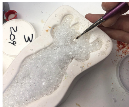
Back everything with F3 Clear until the total frit weight is about 100 grams. Sweep the frit back well away from the post and fire to a Full Fuse using your preferred schedule or the suggested schedule found in Table I below.