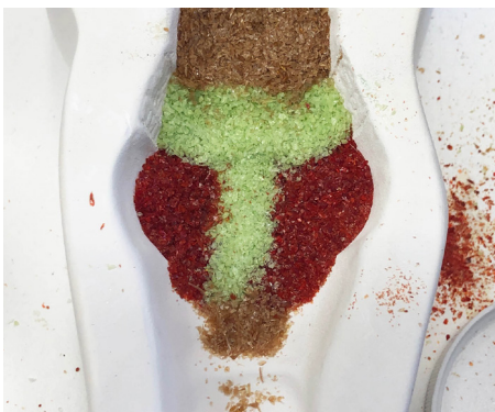
Place a bit of F2 Chestnut below the sweater for the rest of the body. If desired, nip some Dichroic Sheet Glass into pieces and place dichro side down into the icicle portion of the mold for added shimmer.