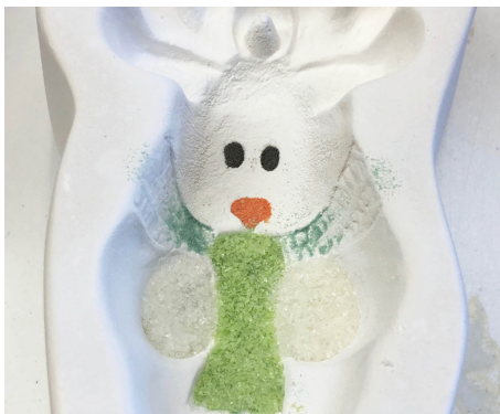
Place F2 Almond over the Black in the hooves and fill the cuffs around them as well.