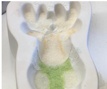
Place F2 Almond into the muzzle and eye area of the face, the base of the ears, and into the antlers.