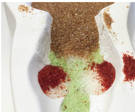
Place F2 Red Opal into the sweater and sleeve area.