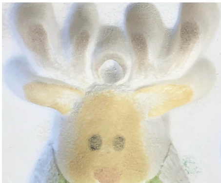
Sift F1 Bronze into the antlers.