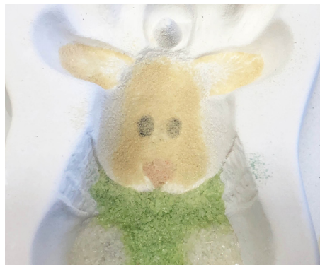
Cover the scarf with F2 Amazon Green. Sift F1 Med. Amber into the face and ears.