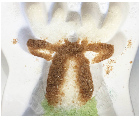
Line the outside of the face and ears with F2 Chestnut.