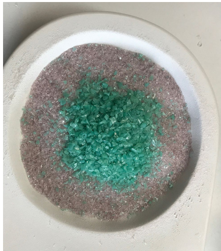
Step 3: Place F2 Apple Jade Opal into the center.