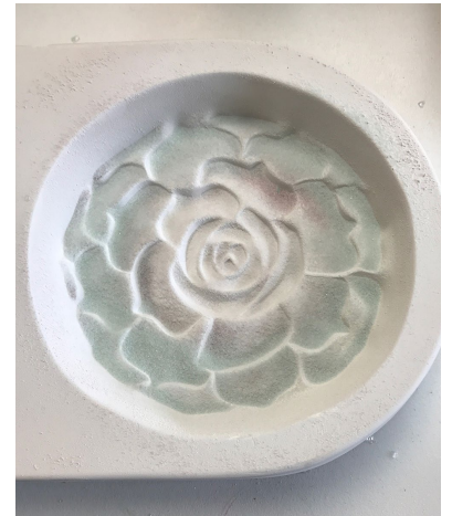
Step 2: Sift F1 Sea Green Trans. into the petals around the outer edge.