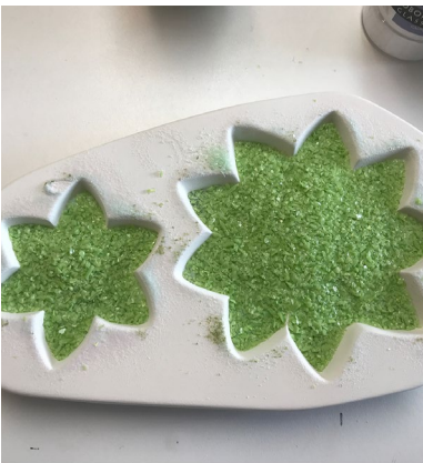
Step 5: Back each succulent with F3 Amazon Green until the Large holds 90 grams and the Small holds 36 grams.

Once filled, fire to a Full Fuse using the suggested schedule in Table 1 below or your own preferred Full Fuse schedule.