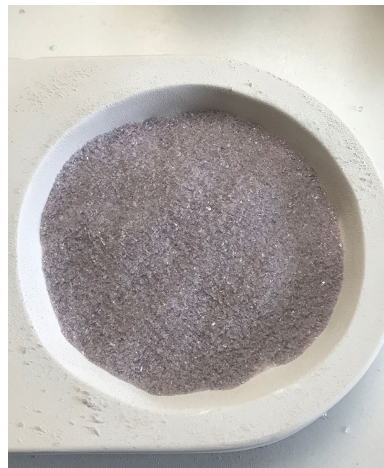
Step 4: Back with F2 Lilac Opal until holding 110 grams.

Once full, fire the mold with Succulents 2 and 3 to a Full Fuse using the suggested schedule in Table 1 on Page 2 or your own preferred Full Fuse.