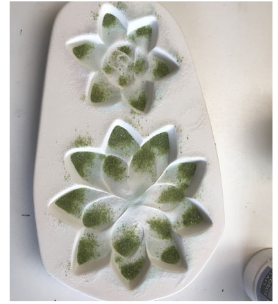
Step 4: Place F2 Olive Opal in the edges of the petals.