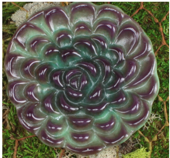
COE96: - F1 Turns Pink Trans. - F2 Pale Purple Trans. - F2 Apple Jade Opal - F2 Pastel Green Opal