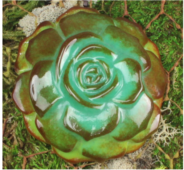
COE96: - F1 Rust Trans. - F1 Peacock Green Opal - F2 Amazon Green Opal