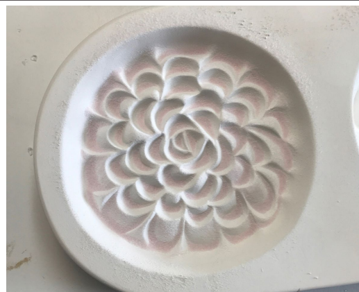
Step 1: Sift F1 Turns Pink Trans. into the lowest parts of the succulent.