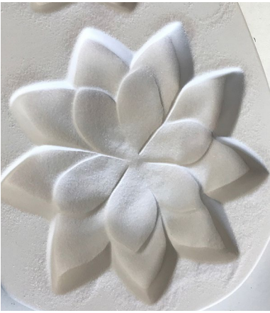
Step 2: Sift F1 Crystal Opal over the whole succulent.