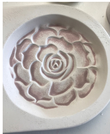
Step 1: Sift F1 Plum Opal into the lowest areas, focusing more on the petal edges.