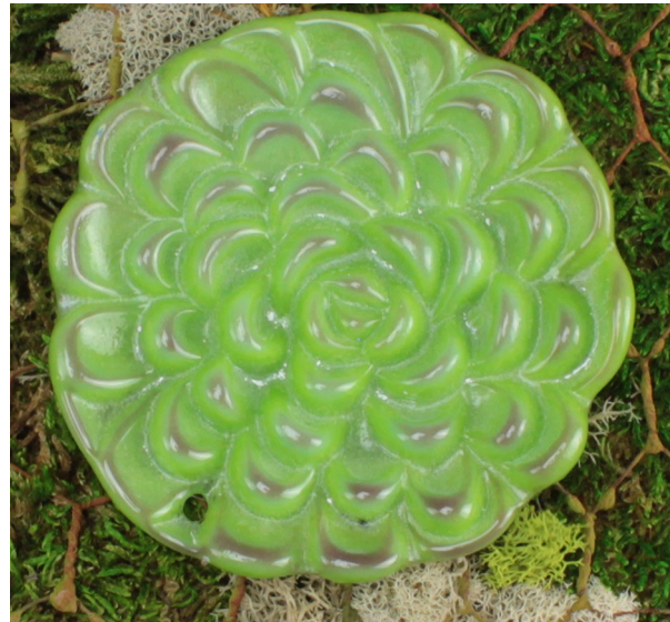
COE96: - F1 Mauve Opal - F1 Lilac Opal - F2 Amazon Green Opal