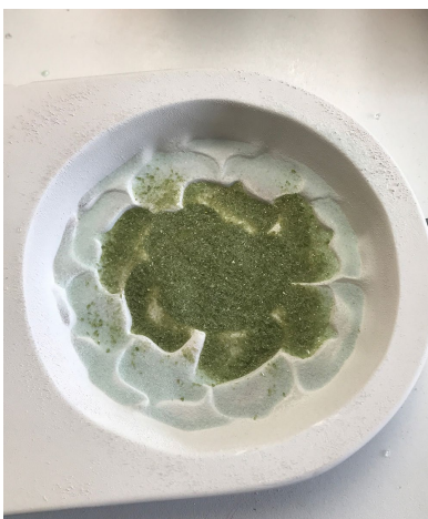
Step 3: Place F2 Olive Green Opal into the center.