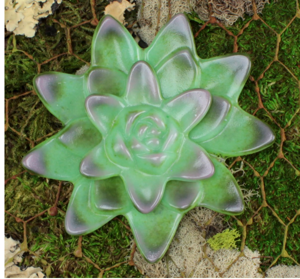
COE96: - F1 Mauve Opal - F1 Crystal Opal - F2 Olive Opal - F2 Pastel Green Opal - F3 Amazon Green Opal