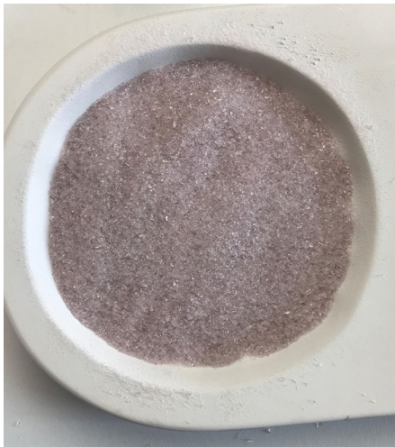
Step 2: Back with F2 Pale Purple.