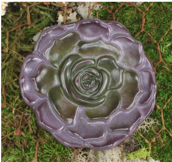
COE96: - F1 Plum Opal - F1 Sea Green Trans. - F2 Olive Opal - F2 Lilac Opal