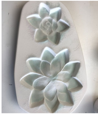
Step 3: Sift F1 Pastel Green Opal along petal edges.