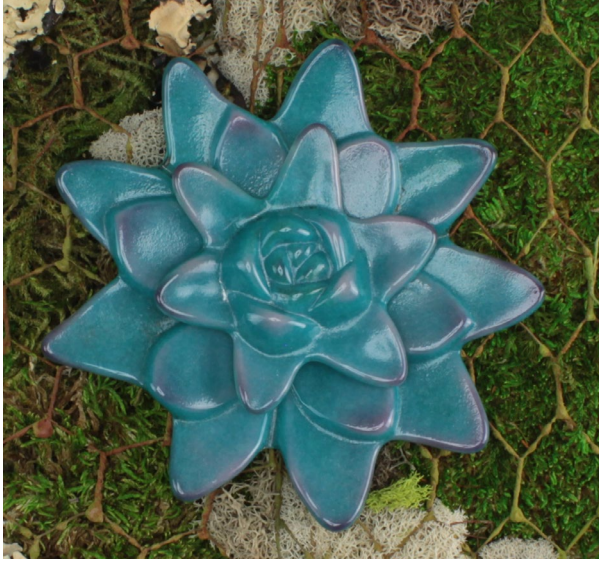
COE96: - F1 Lilac Opal - F1 Mauve Opal - F2 Apple Jade Opal