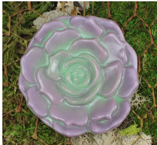
COE96: - F1 Mauve Opal - F1 Lilac Opal - F2 Pastel Green Opal