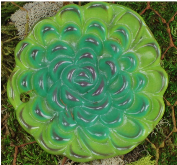
COE96: - F1 Lilac Opal - F1 Peacock Green Opal - F2 Amazon Green Opal