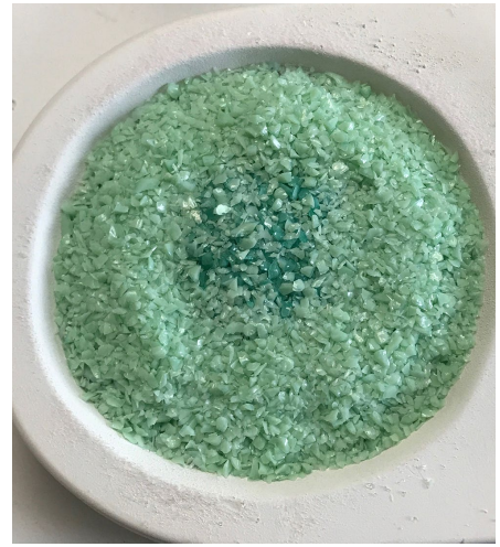
Step 4: Fill with F3 Pastel Green Opal until holding 85 grams.