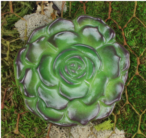
COE96: - F1 Plum Opal - F1 Olive Opal - F2 Amazon Green Opal