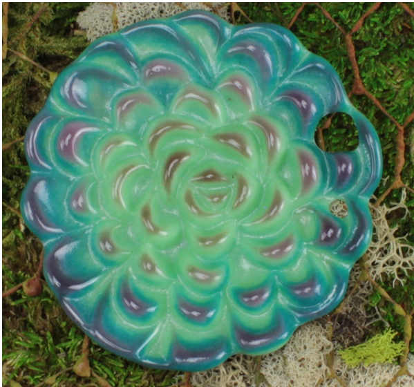
COE96: - F1 Lilac Opal - F1 Peacock Green Opal - F2 Pastel Green Opal