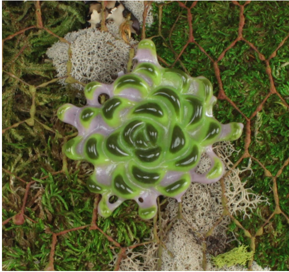
COE96: - F1 Olive Green Opal - F1 Amazon Green Opal - F2 Lilac Opal - Filled to only 32g