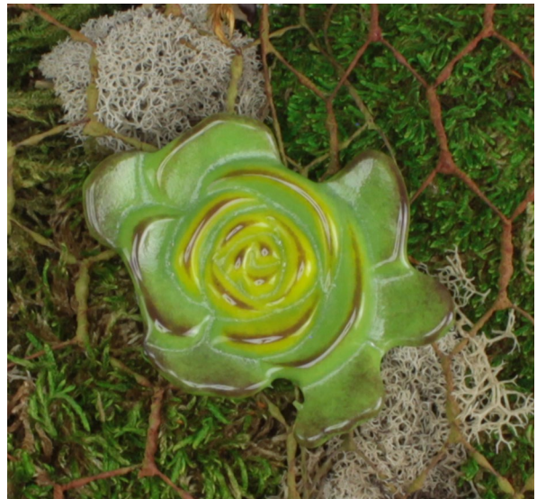
COE96: - F1 Turns Pink Trans, - F1 Lemongrass Opal - F2 Amazon Green Opal - Filled to only 20g