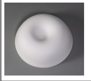
GM53 Large Slump with <u>Hump</u>