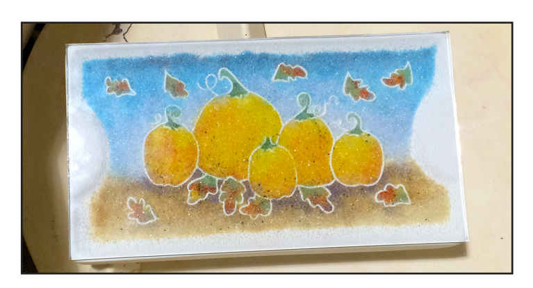
Once you're happy with your frit placement, cut and clean a 7.25" x 13.25" rectangle of Double Thick Clear. Place the frit-filled mold on 1" kiln posts in the kiln and center the Clear sheet on top of it. Fire using the suggested One-and-Done schedule in <u>Table 1</u>.

*Before firing, it's important to know your kiln. For tips on how to do that, please click here to see our Important <u>Firing Notes!</u>