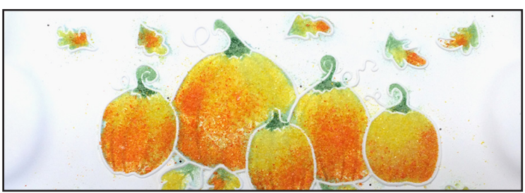
Sprinkle F2 Yellow into the tops of the pumpkins and middle of the leaves. Add some F2 Light Orange to the bottoms of the pumpkins and middle of the leaves.

Add F2 Teal Green to the base of the pumpkin stems. Place F2 Medium Green into the remainder of the pumpkin stems as well as the stems of the leaves in the rest of the scene. An Earwax Vacuum, shown above, is a useful tool for precise frit removal.