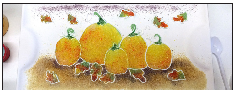
Add F2 Pale Amber down to the bottom edge of the mold and blend with the Medium Amber above it. Sprinkle a bit of F2 Grape along the top of the sky.