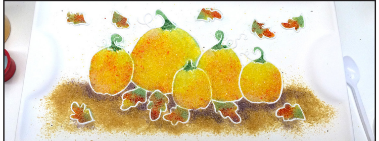
Place some F2 Dark Amber around the base of the pumpkins. Blend some F2 Medium Amber from the Dark Amber out and around the leaves on the ground.