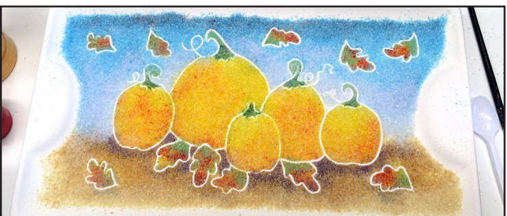
Fill the void around the pumpkins with F2 Sapphire and blend upwards into the Blue Topaz in the sky.