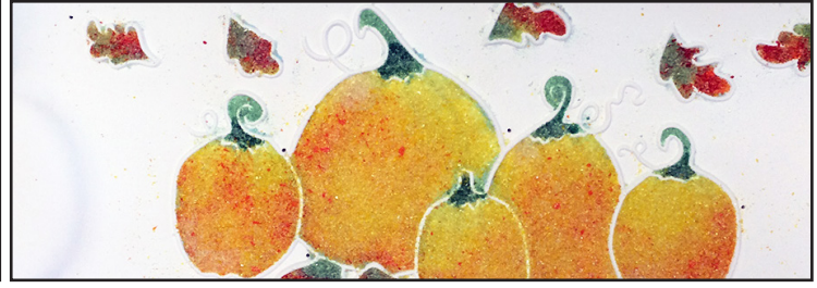
Blend a layer of F2 Tangerine over the Light Orange and Yellow in the pumpkins. Add a bit of F2 Light Cherry Red to the tips of the leaves and fill the leaves a bit more with some additional F2 Light Green.