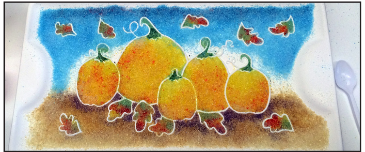
Blend F2 Deep Aqua over the Grape and continue down about 1.5" into the sky. Blend F2 Blue Topaz over the Deep Aqua and into the rest of the sky, leaving some empty space around the pumpkins.