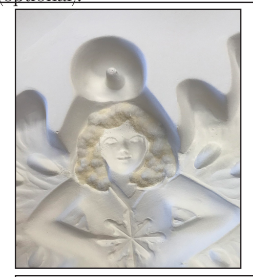
Use a small powder applicator or pipette to fill the Fairy's hair with F1 Pale Amber. Place F1 Almond Opal over the Pale Amber.

Materials: Creative Paradise, Inc. Mold LF176, Powder sifter, Mosaic Nipper, Pipette, ZYP. COE 96: F1 Powdered Frits, F2 Fine Frits, F3 Medium Clear frit, Clear glass rods/Clear sheet glass, Dichroic glass, Liquid fired silver (optional).