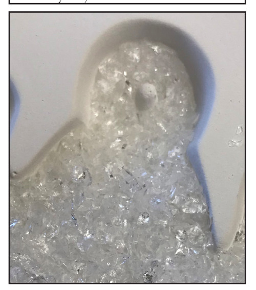
Gently sweep the frit away from the post with a paint brush or similar tool to prevent burrs. Fire the mold using the schedule found in table 1.