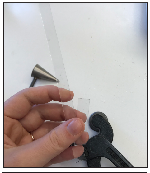
Fill the icicle cavity up with the rod and/ or sheet glass. This will help the icicle part of the project to have fewer Champagne bubbles (than if you had used only frit).