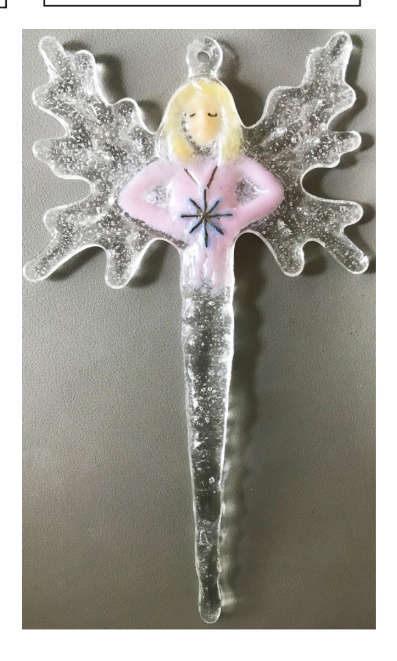
Tip: To remove your ornament from the mold after firing, gently turn the mold upside down on a soft surface and slowly let the glass come out. Do not try to pick the glass out of the mold from the top as you may pry the post off.