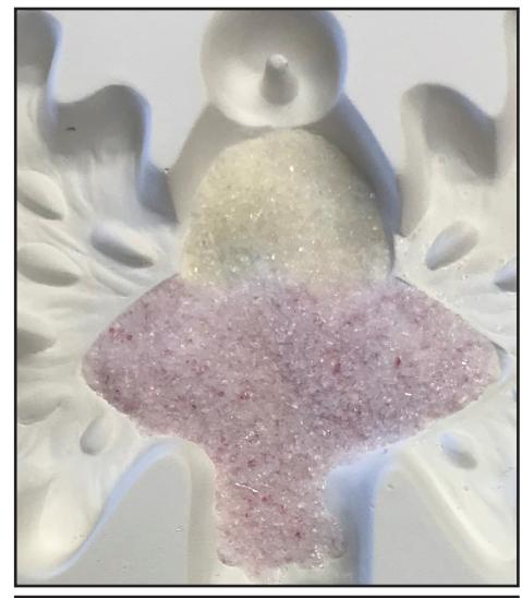
Place F2 Almond over the face and hair area of the Fairy. Fill the dress with F2 Cherry Blossom.