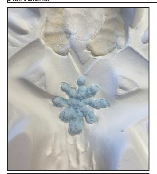
Fill the Fairy's snowflake with F1 Riviera Blue Opal.

Always wear a mask when using powdered frits. Spray your CPI molds with ZYP glass separator before using.