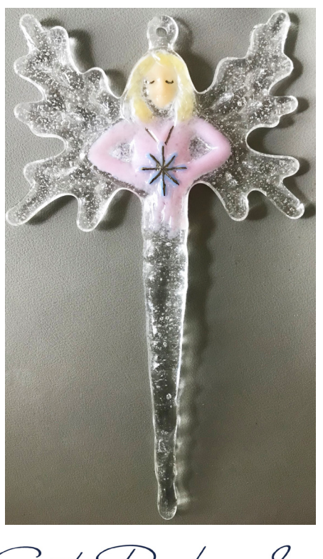
Creative Paradise Inc.

Always wear a mask when using powdered frits. Spray your CPI molds with ZYP glass separator before using.