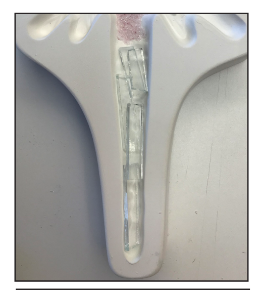
If desired add thin slivers of Clear Dichroic glass amongst the sheet glass. This will add a shiny glimmer to the icicle once fired.