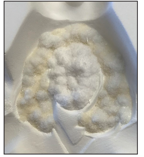
Fill the Fairy's face with F1 Champagne Opal. Pat the poweder into place with your finger.