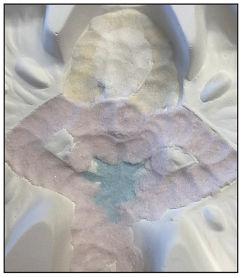
Place some F1 Cherry Blossom into the Fairy's dress.