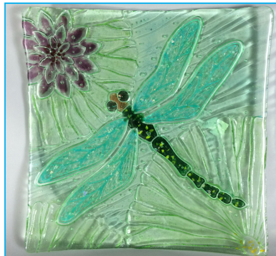
This slumped sample was made using various frit colors, Ming Green sheet glass followed by Clear sheet glass placed on top. All COE96 Glass.

For tutorials, molds, info and more go to www.creativeparadiseglass.com