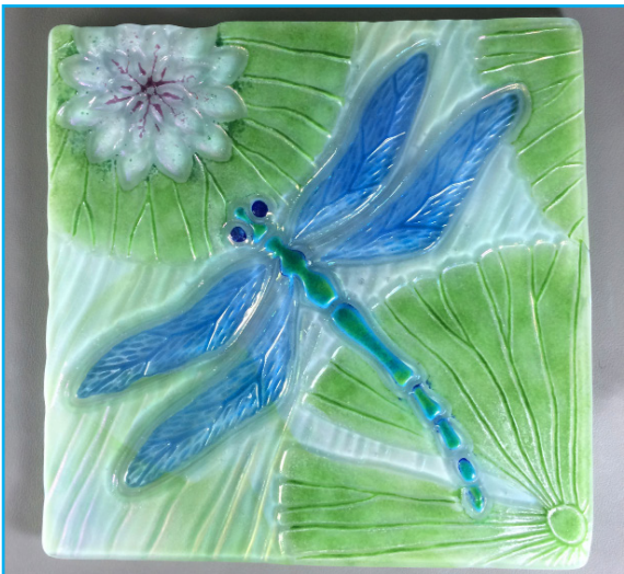
This sample was made using various frit colors, Clear Irid sheet glass, placed Irid side down on the mold, followed by Sour Apple Opal Art sheet glass with the vivid pattern of the Sour Apple Opal Art facing away from the texture. All COE96 Glass.