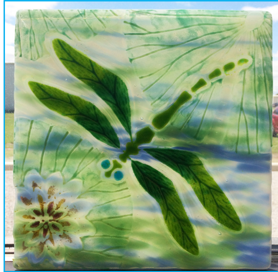
This is the fused DT31 featured in this tutorial propped up against a window to show you how the sunlight shines through the glass.