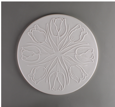
DT35 Round Tulip Texture 10.25" Dia.