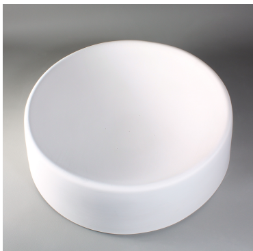
GMI25 Patty Gray Large Round Slump 12" Dia.