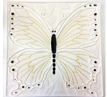
Place F2 Medium Amber into the veins of the wings. Use your finger to aently press the powder down into the crevices but be careful to not overly disturb the separator.