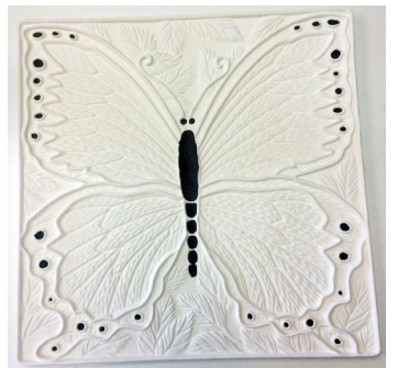
Once your separator has fully dried, begin by carefully adding F1 Black to the butterfly's body and the spots on the edges of the wings and head.

on ZYP. Make sure to always wear a mask when using spray-on separator and/or powder frits.