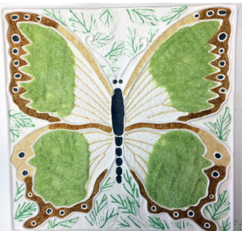
Add F2 Lime Transparent to the wings as shown above.