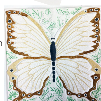
Place F1 Dark Green in the leaf veins outside the butterfly and gently press it into the crevices with your finger just as you did with the veins in the butterfly's wings.