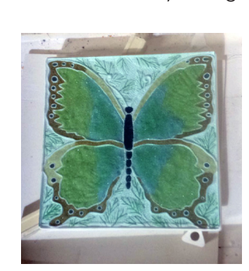
Cut and clean a 10" x 10" square of Ming Green and center it on the frit-filled mold. Transfer the project onto 1" kiln posts on a level shelf in the kiln and fire using the suggested Tack Firing schedule in Table 1 or your own preferred Tack Fire.