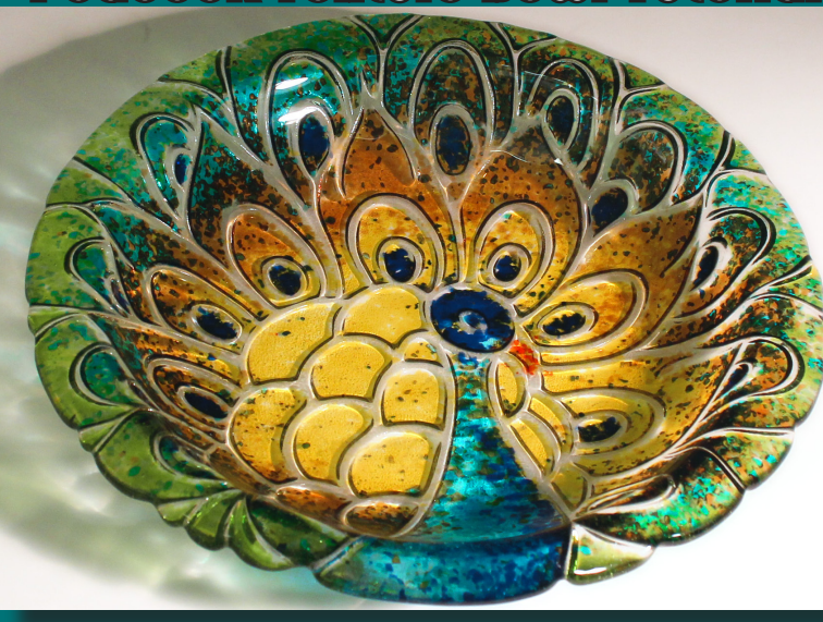
Use Creative Paradise, Inc. molds DT19 Peacock Texture & GM66 Shallow Bowl with fusible glass to make a stunning fused, textured, and slumped glass peacock bowl.