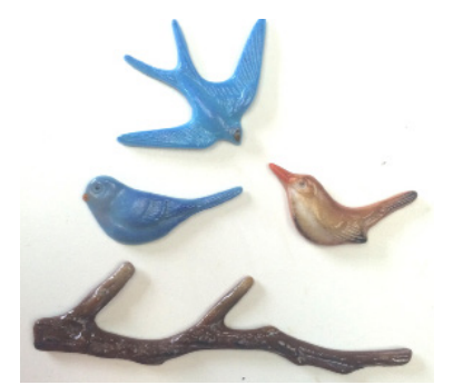
After firing the glass and allowing it to to cool naturally, de mold the glass and wash the frit castings to remove any residual glass separator.