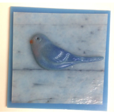
Cut a 3.75" square of the Black Frit/ Streamer on White glass with a black streamer in the center of the glass. Cut a 4" square of Riviera Blue. Place the Black Frit Streamer glass with the vivid side of the glass down on the Riviera Blue and place the sitting blue bird in the center along the faded black streamer.