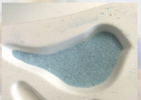
Fill the top sitting bird cavity with 16 grams of fine Alpine Blue opal frit.