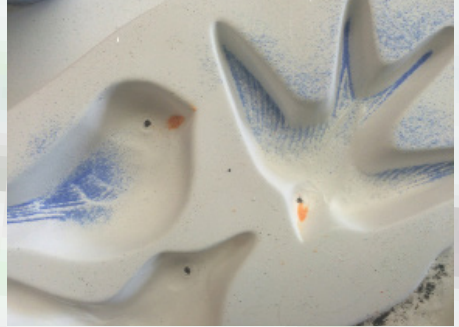
Place a small bit of powdered Orange Opal frit in the birds beaks. Sift powdered Cobalt in the edges of the tail and wings of the top bird and the flying bird.

Treat the frit casting mold with Zyp making sure to hold the mold at various angles while spraying. Place a small amount of powdered Black frit in the eyes of the birds. Sift a bit into the top deep areas of the bark on the twig.