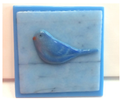
Fire the blue sitting bird on the sheet glass using the firing schedule found in Table 2. It is also possible to "pre-fuse" the sheet glass and then tack fire the bird into place as shown in the next section