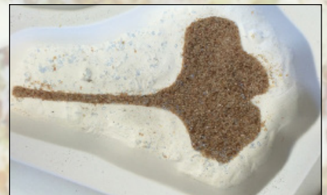
Place F2 Chestnut Opal into the fossil portion of the cavities. Sweep any Chestnut that strays from the areas surrounding the fish and ginkgo leaf back into the fossil itself. Sprinkle a bit of F2 Pale Blue into the area around the fish and ginkgo leaf.