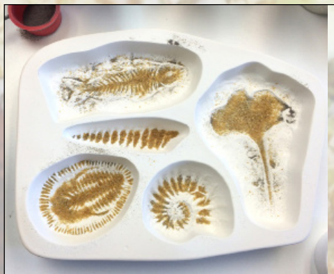
Add F2 Medium Amber on top of the Black.