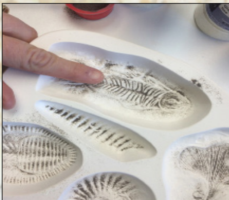
After your LF140 is primed and dry, sift F1 Black into each fossil and gently sweep it into the fine details with a finger. Take care to not move or remove any separator.