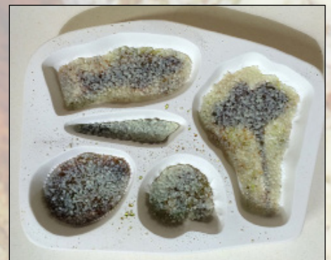
Place the filled mold into a kiln and Tack Fire using the following schedule.

Rate 1: 350, Temp 1: 1390°F, Hold 1: 05 min Rate 2: 9999, Temp 2: 950°F*, Hold 2: 60 min The glass will still be quite textural after firing as shown above.