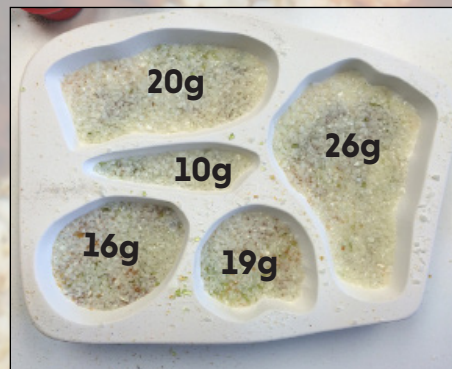
Add a layer of F3 Vanilla Cream to each mold until they're approximately 1/4" full of frit. If using fill weights, refer to the above image.