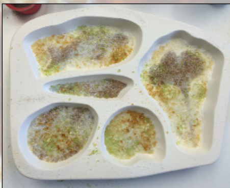
Place a mixture of F2 Vanilla Cream, F3 Lime Green, and F3 Medium Amber into each cavity to cover the Chestnut.