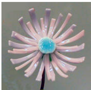
Table 1: Full Fuse*